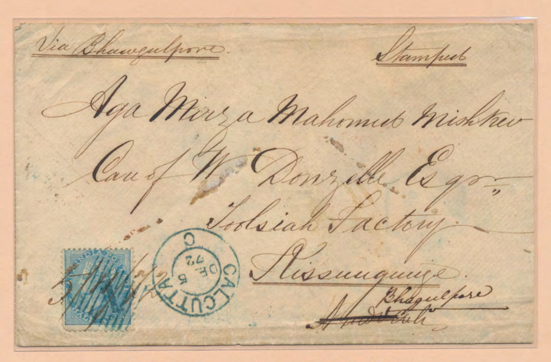
Calcutta 1, 5 December, 1872 to Bhagulpore. JC type 10a Variety - C at the bottom of c.d.s.