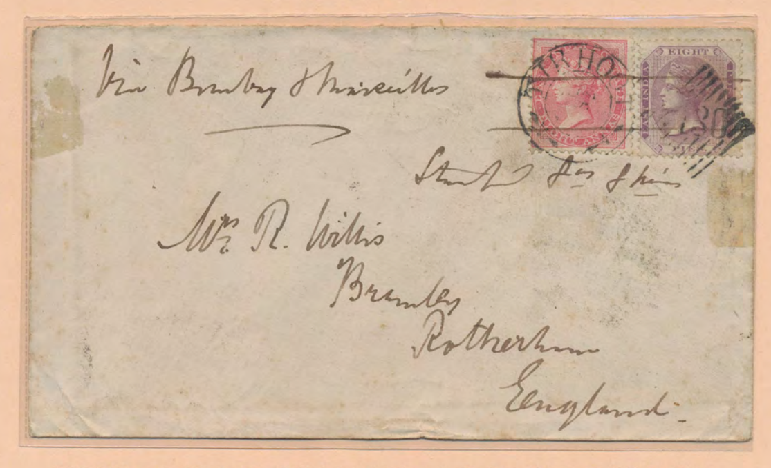
130 Tirhoot, 28 June, 1868 to England via Bombay and Brindisi. Postage 8a 8p. T.P.O. c.d.s. on reverse