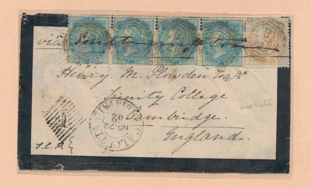
Howrah B/2, 22 November, 1862 to England