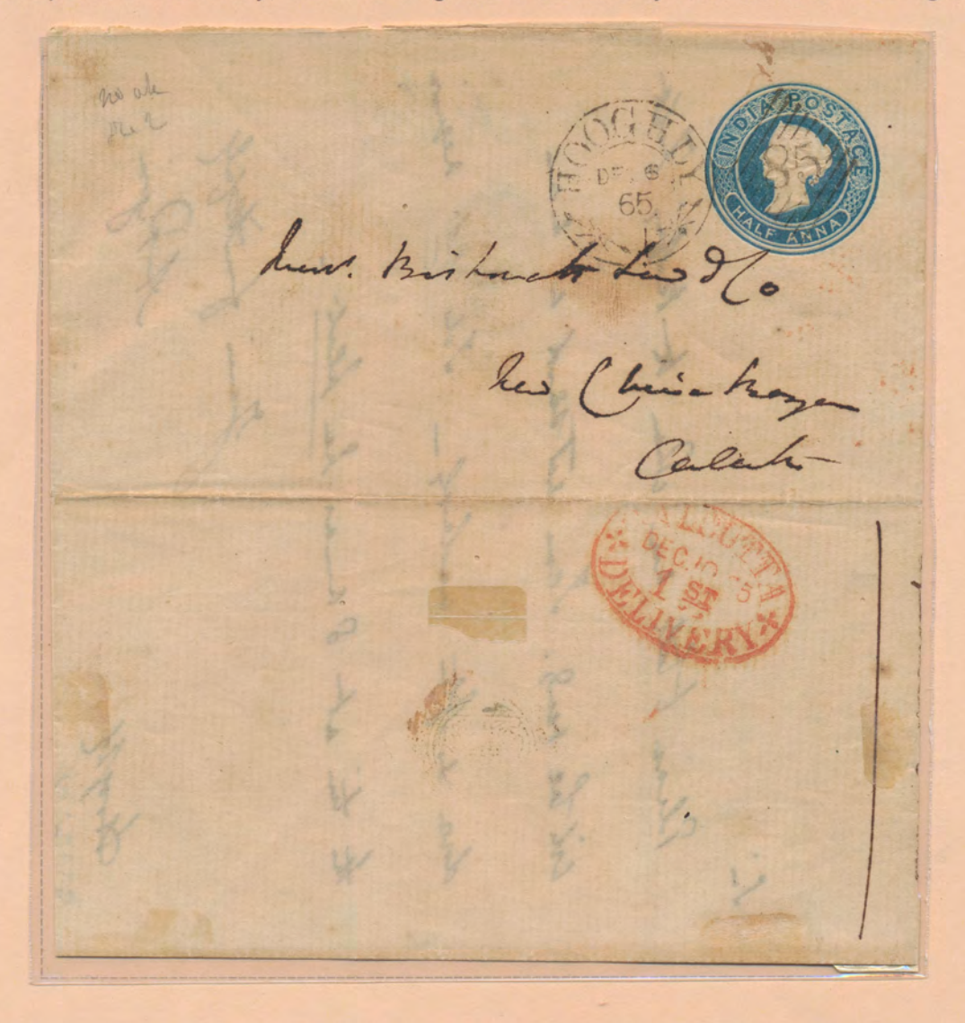
85 Hooghly, 6 December, 1865 to Calcutta

75 Dinapore, 2 February, 1871 to England via Bombay and Brindisi. Postage 8a