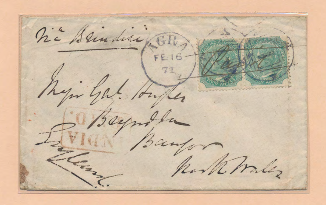
1 Agra, 16 February, 1871 to England via Bombay and Brindisi