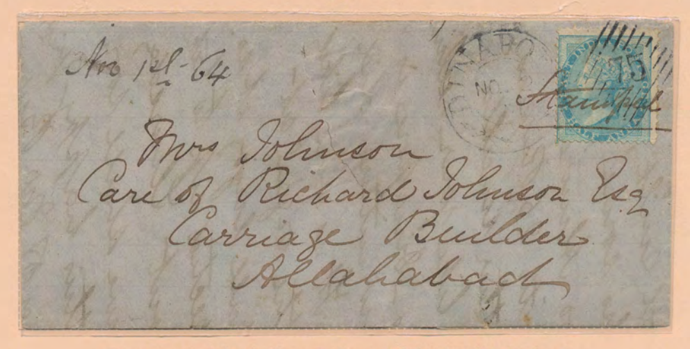
Dinapore 75, 2 November, 1864 to Allahabad