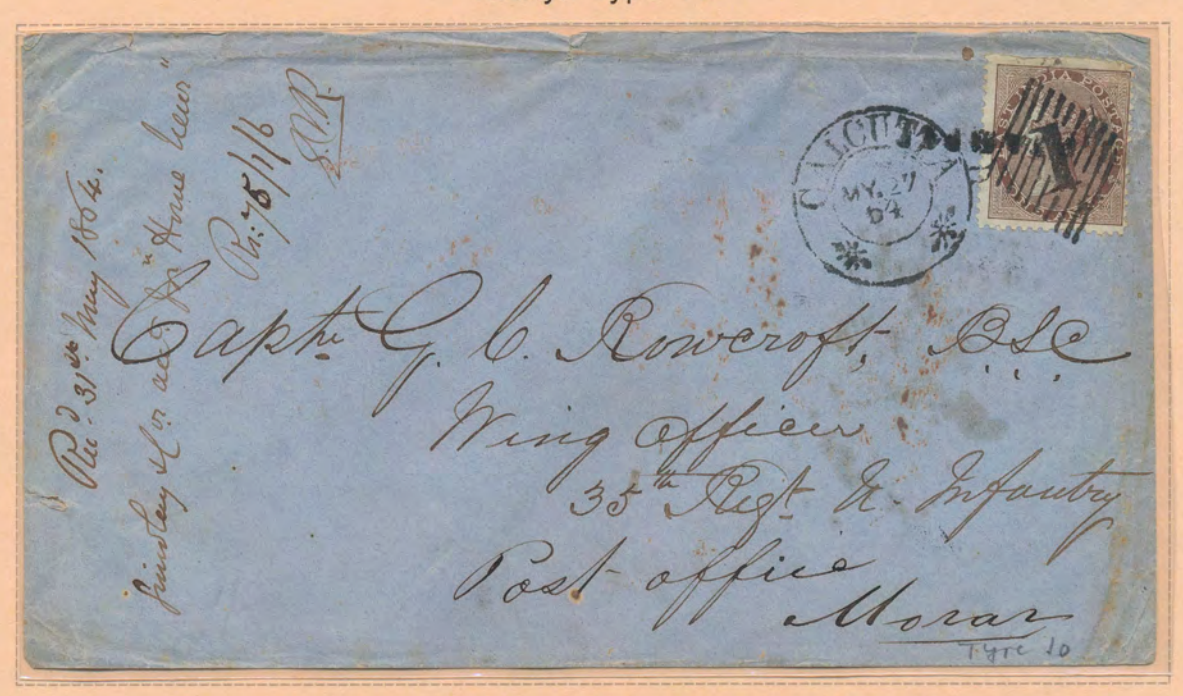
1 Calcutta, 27 May, 1864 to Gwalior (Morar)