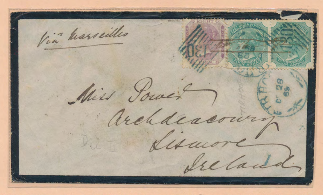
130 Tirhoot, 28 December, 1869 to Ireland via Marseilles. Postage 8a 8p. T.P.O. c.d.s. on reverse