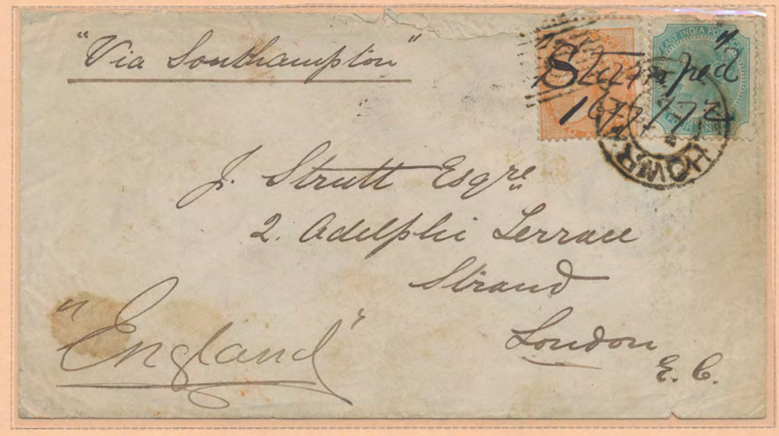
2 Howrah (Calcutta) 12 July, 1872 to England via Bombay and Southampton. Postage 6a