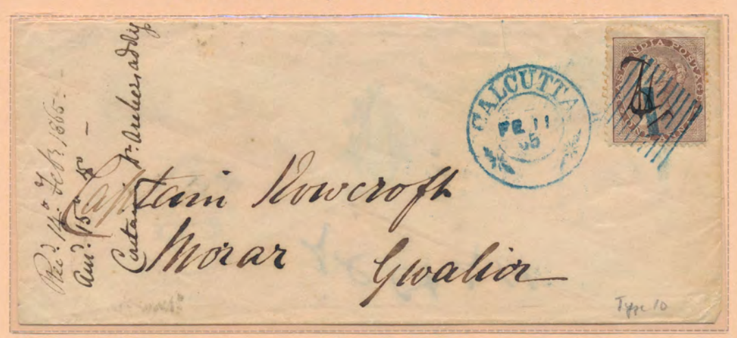
1 Calcutta, 11 February, 1865 to Gwalior (Morar) Cancellation in blue-grey