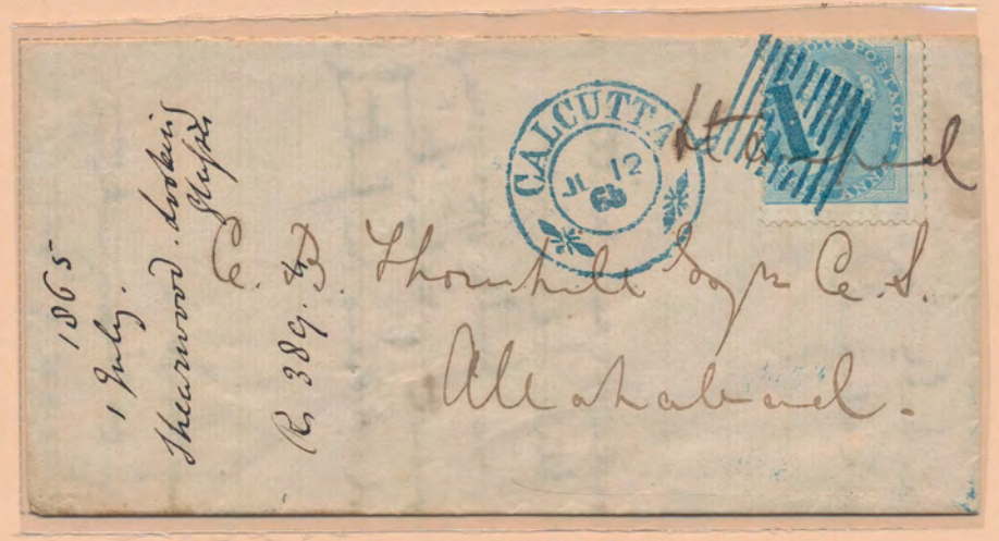
Calcutta 1, 12 July, 1865 to Allahabad. JC 10a (variety)