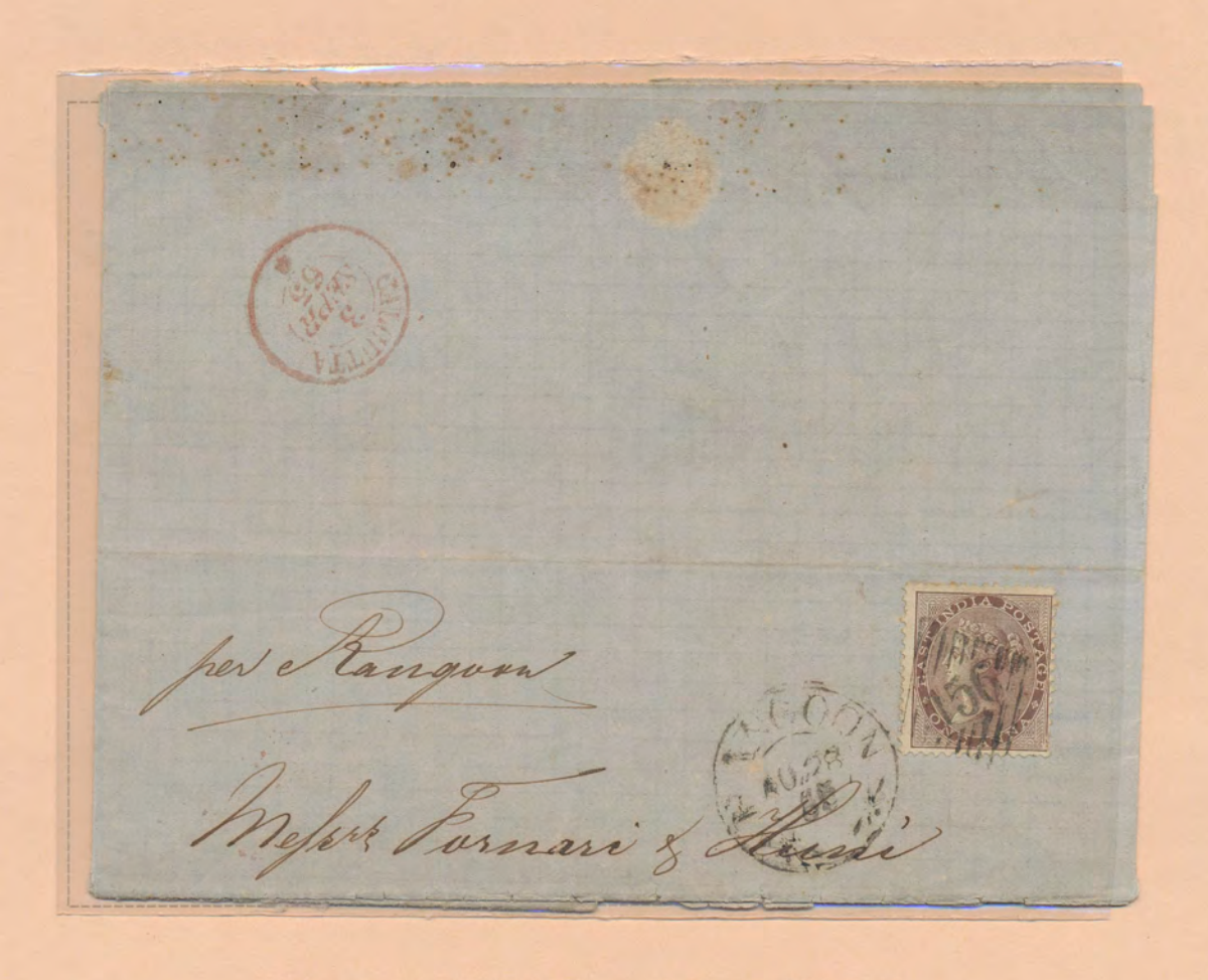
Rangoon 156, 28 August, 1865 to Calcutta