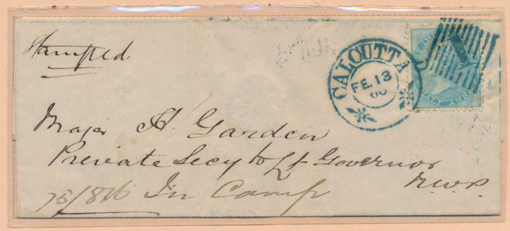
Calcutta 1, 13 February, 1866 addressed to LIEUT I. GOV RS N W P CAMP P.O. JC 10a (veriety)