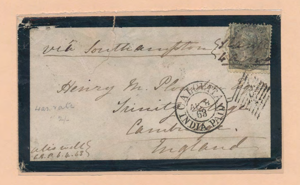
Calcutta B/1, 8 April, 1863 to England

Mn Type 7 and Mn Type 10 in Comination used as despatch Post marks for Foreign Mail cancellation