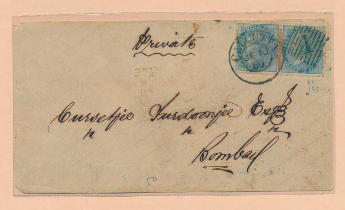
Calcutta 1, 10 December, 1869 to Bombay (Colaba)

JC / 10a Type - Duplex Bengal Circle - Calcutta City