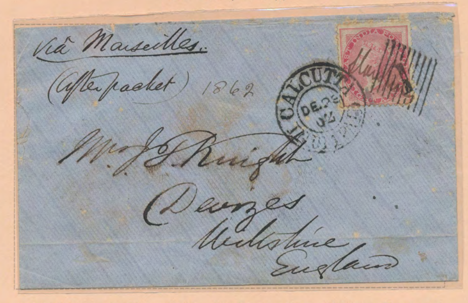
CALCUTTA / INDIA PAID, 23 December, 1862 to England Cancellation in black ink.