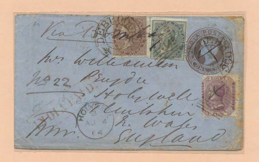
Debrugurh 69, 27 July, 1864 to Scotland