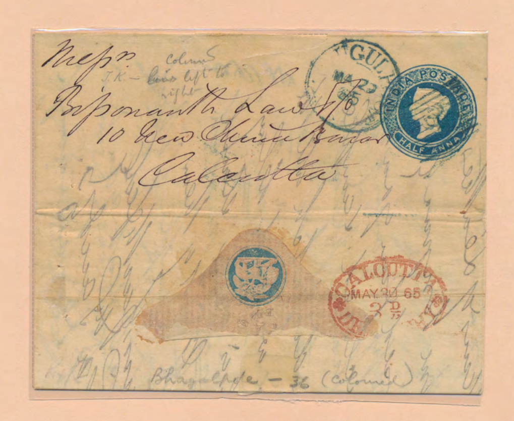
Bhaugulpore 36, 23 March, 1865 to Calcutta

Dinapore 75, 23 October, 1866 to England "CALCUTTA / INDIA PAID / 0C 25 / 66" c.d.s. on back