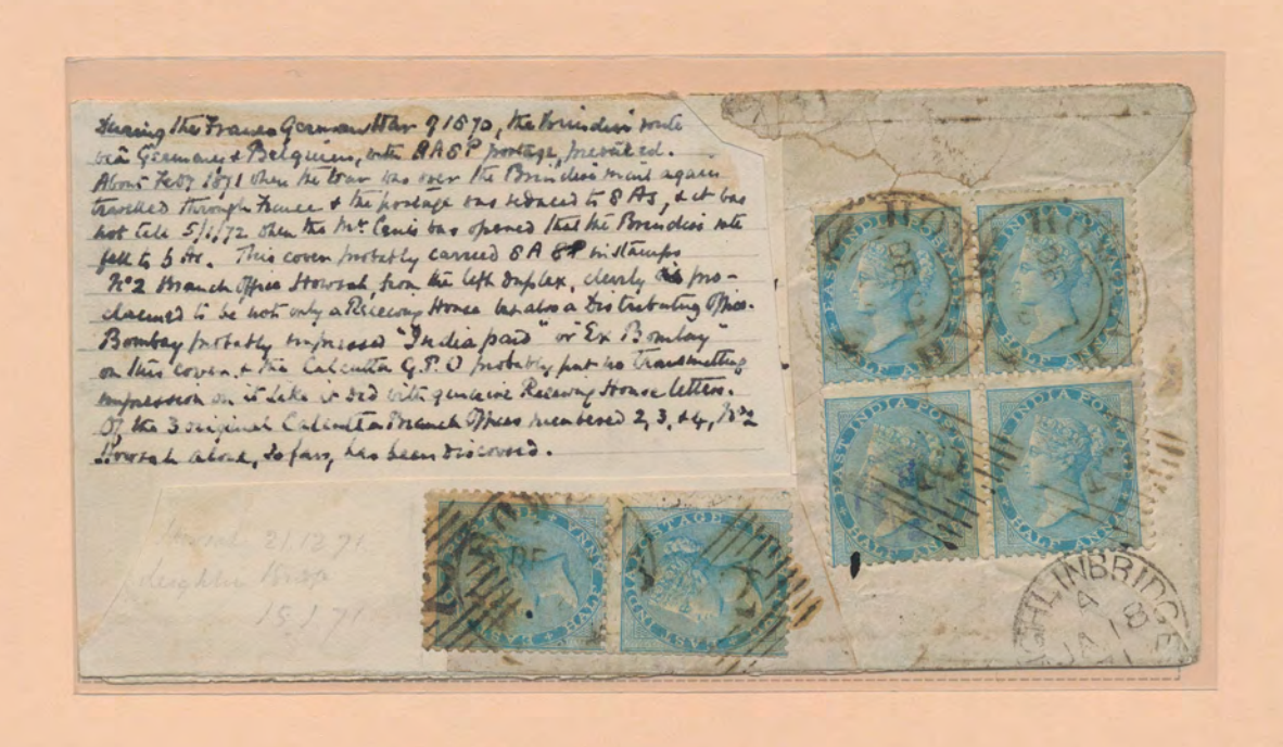
Howrah 2, 21 December, 1870 to Ireland History of this cover in manuscript on the cover